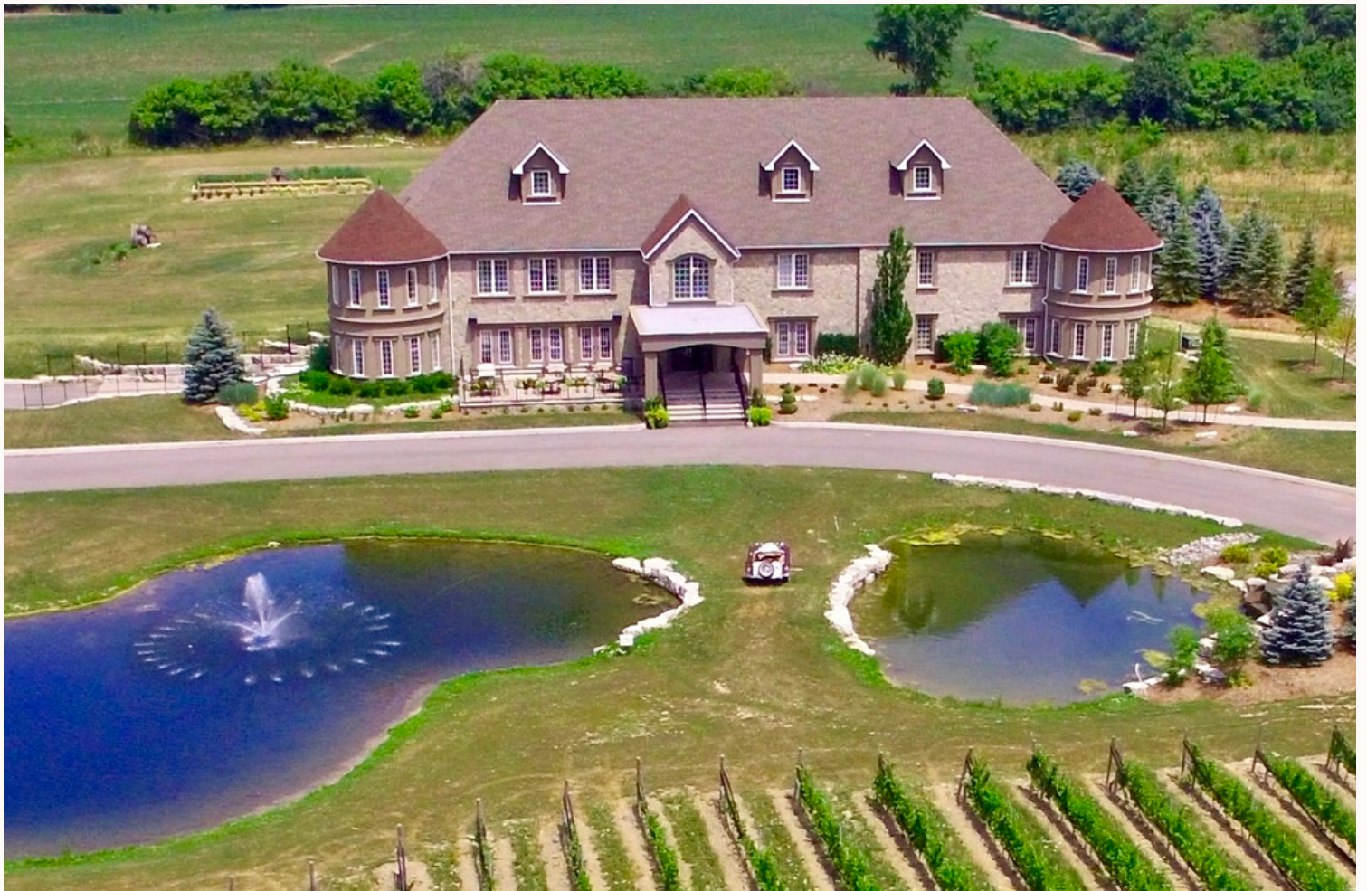
Front view of our estate winery

Our stunning estate is situated on 60 acres of vibrant gardens and vineyards. With a pergola, tranquil pond with a waterfall feature, and well-maintained gardens, this is an ideal setting for outdoor ceremonies and for beautiful wedding photos as well.